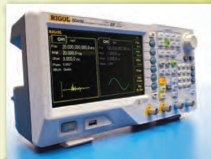
DG4000 Waveform Generator