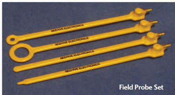
Field Probe Set